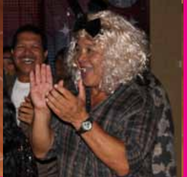
See if you can guess the cast of characters who came dressed to boogie at GCC's Disco Christmas Party on Dec. 6 at the Westin Resort Guam! Hint: The chick in hot pink shows us the money!