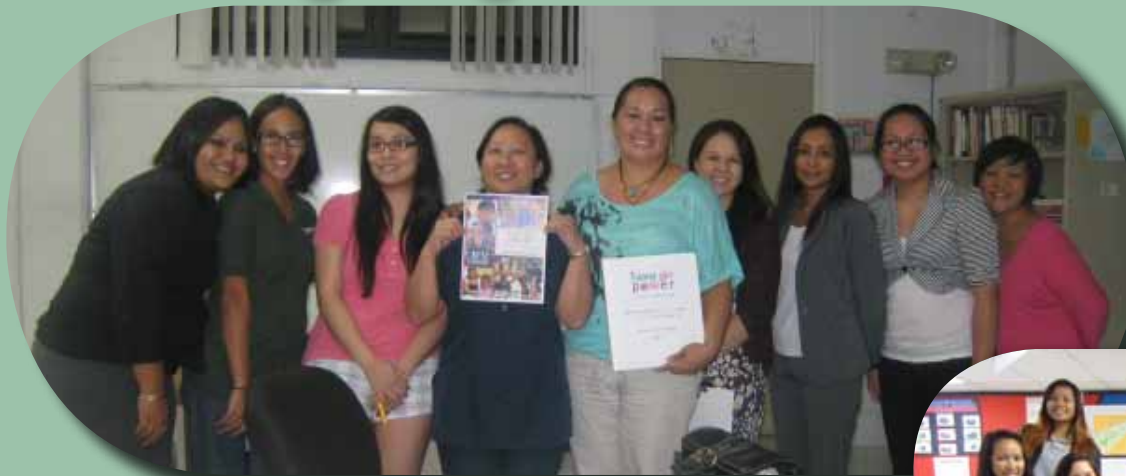
Accounting students display the business plan they prepared for Island Girl Power.